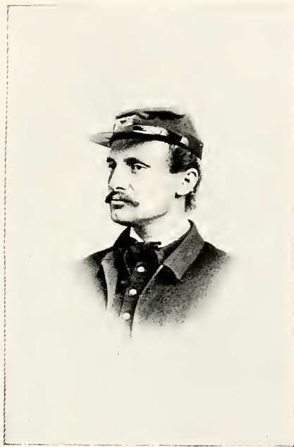
COL. EDWARD N. HALLOWELL.